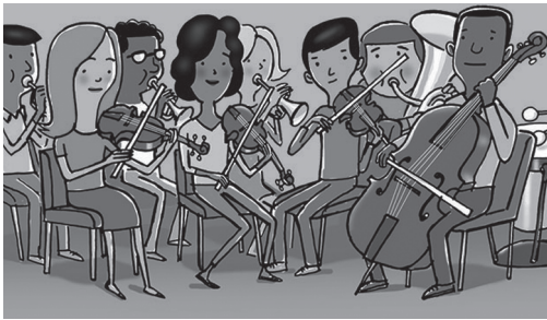
1. play in the school orchestra