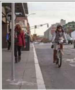
I ride a bicycle to class.