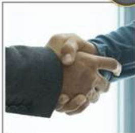
It's nice to meet you.

A. Read the sentences. Then listen to all three conversations. Write T (true), F (false), or N (not enough information).