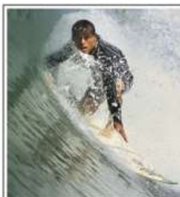
People surf at East Beach.